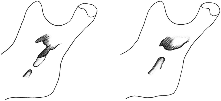
Fig. 1. Two types of the mylohyoid canal: the bridge type (left) and the lingular type (right).