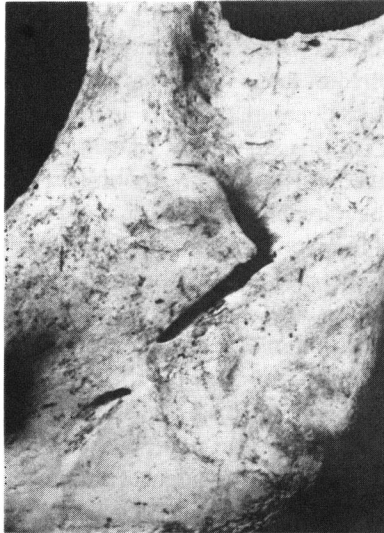
Fig. 2. Bridge type mylohyoid canal in an Ainu mandible (Hamatōei 6). A bony ridge for muscle attachment extends from the pterygoid tuberosity antero-superiorly and traverses the mylohyoid groove over the bony plate of the mylohyoid canal.