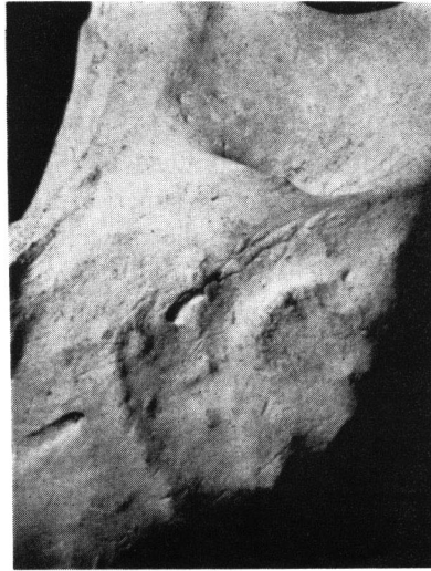
Fig. 4. Typical lingular bridging accompanied by a long bridge type canal in a prehistoric mandible (Bōzuyama VI-2). Four bony ridges for the medial pterygoid muscle traverse the groove over these bridges.

relationship between the mylohyoid canal of both types and the insertion of the medial pterygoid muscle.