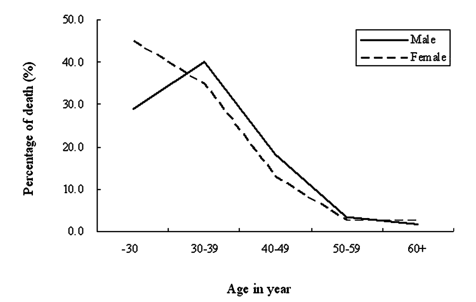
Fig. 7. Comparison of percentage of dead individuals in each sex for Ikenohata-shichikencho.