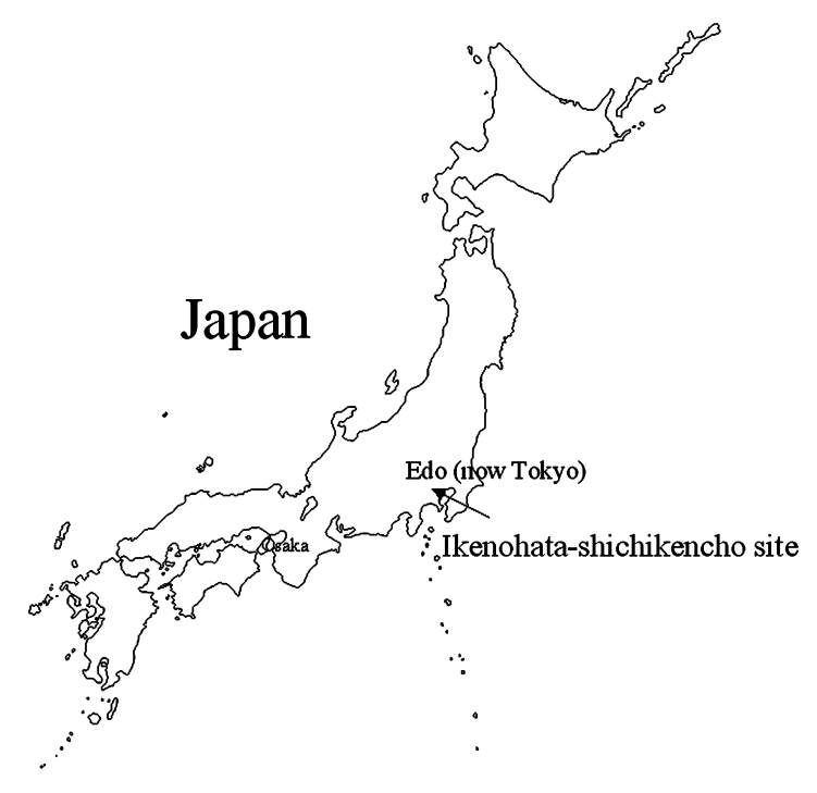
Fig. 1. Map of Japan showing the location of the Ikenohata-shichikencho site.

whether the Ikenohata-shichikencho sample represents the demographic structure of the Edo people. Furthermore, this study presents basic data on the age and sex estimation of each individual, which forms the basis for future studies on the osteology of the Edo Japanese.