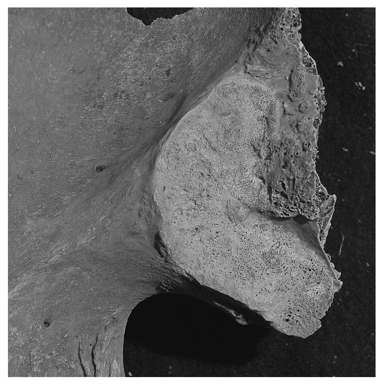
Fig. 4. Age stage 6 of the auricular surface of the ilium (No. 89/919/C8).