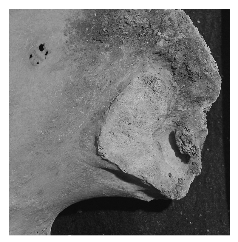
Fig. 3. Age stage 3 of the auricular surface of the ilium (No. 70/808/B1).