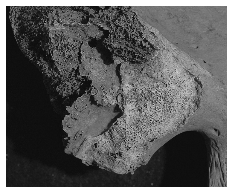
Fig. 5. Age stage 8 of the auricular surface of the ilium (No. 15/343/B3).