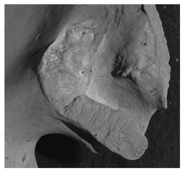
Fig. 2. Age stage 1 of the auricular surface of the ilium (No. 4/599 Futaue/B1).