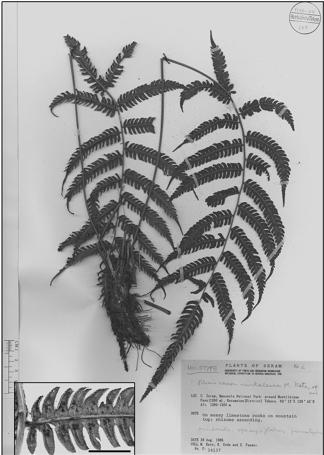
Fig. 2. Plesioneuron murkelense ; holotype (Kato et al. C-14137). Bar in inset=10 mm.