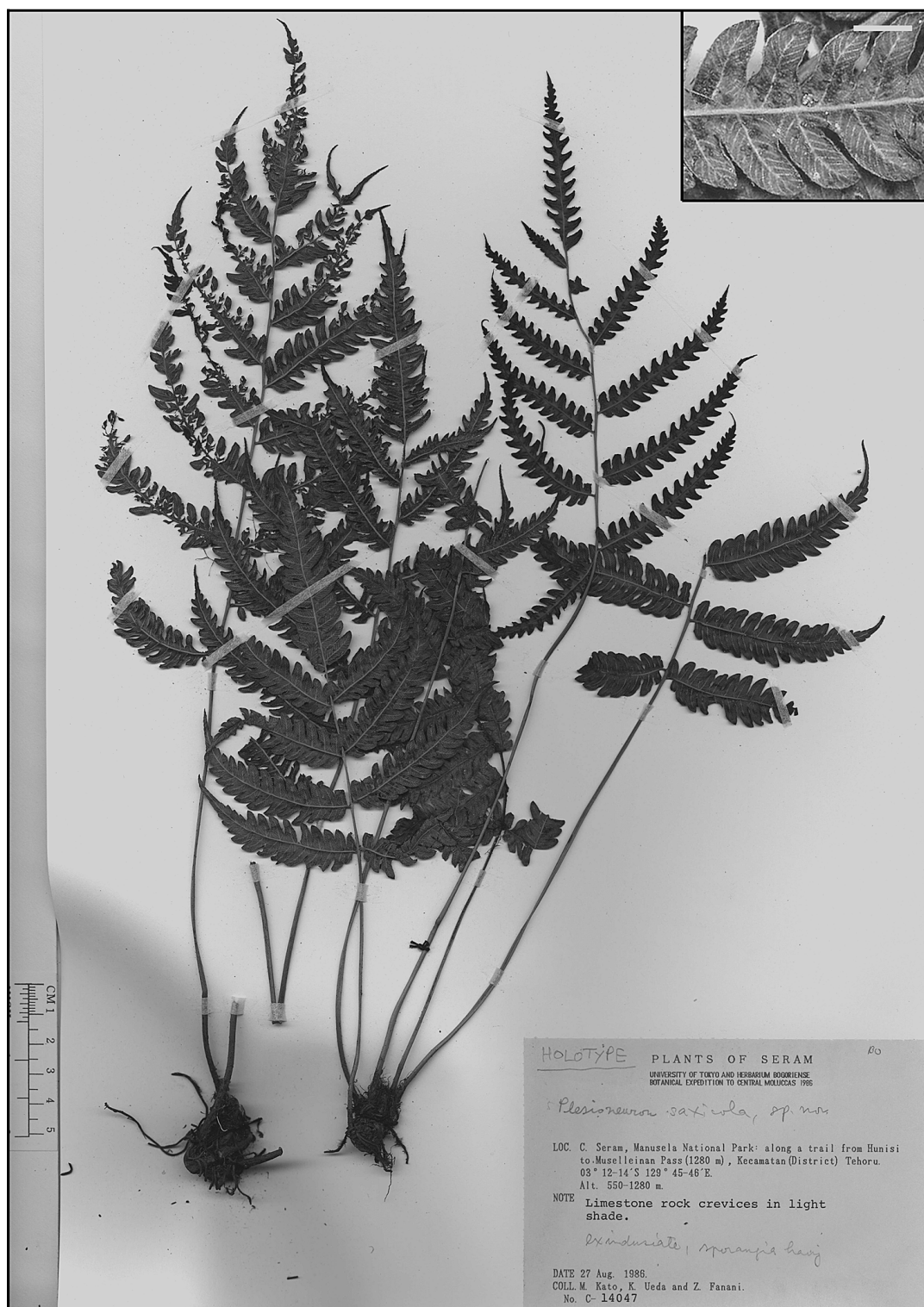
Fig. 3. Plesioneuron saxicola ; holotype (Kato et al. C-14137). Bar in inset=5 mm.