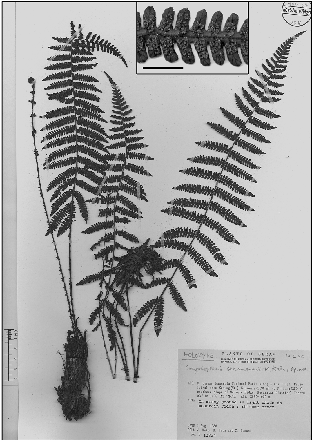
Fig. 1. Coryphopteris seramensis ; holotype (Kato et al. C-12834). Bar in inset=5 mm.