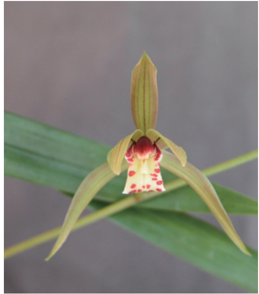
Fig. 2. Cymbidium ×nomachianum T. Yukawa & Nb. Tanaka. Photograph from holotype ( Hort. Kochi Prefectural Makino Botanical Garden, N. Tanaka 078 ).

Planta perennis, terrestris, erecta, usque ad 35 cm alta, radicibus flexuosis. Folia 3–4, lanceolata, 25–35 cm longa, 2.0–2.5 cm lata, glabra, apice acuta, basin versus paulatim decurrentia, margine integra. Racemi circa 10–15 cm longi,