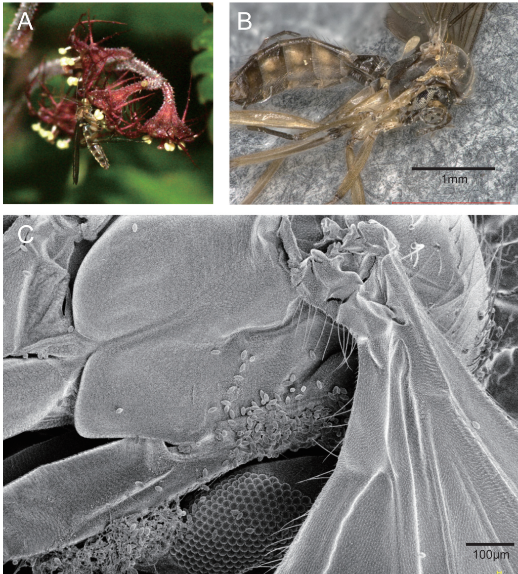
Fig. 1. Coelosia sp. (Mycetophilidae) that visited on the M. formosana flowers. A, Coelosia sp. nectaring on the M. formosana flower. B, A microscopic image of Coelosia sp. collected on a M. formosana flower. Note numerous pollen grains are attached on the anterior side of the body. C, An electron microscopic image of Coelosia sp. collected on a M. formosana flower. The rugby-ball like morphology of pollen grains typical of the pollen grains of Mitella is visible on the insect's surface.

M. japonica and M. yoshinagae (Fig. 2, Okuyama and Kato, 2009), which presumably reflects the ancient floristic link between Taiwan and Japan. Okuyama et al. (2008) classified the floral morphology of M. formosana as “saucer-shape”, implying this species might have rela-