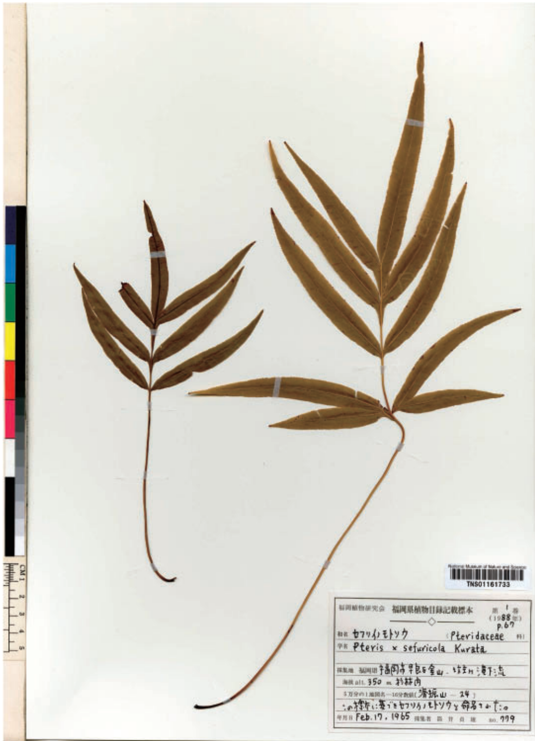
Fig. 3. A winged form of Pteris cretica , a duplicate of the original collection, to which ' P. × sefuricola Sa. Kurata' was given (S. Tsutsui 779, TNS [VS-1161733]).