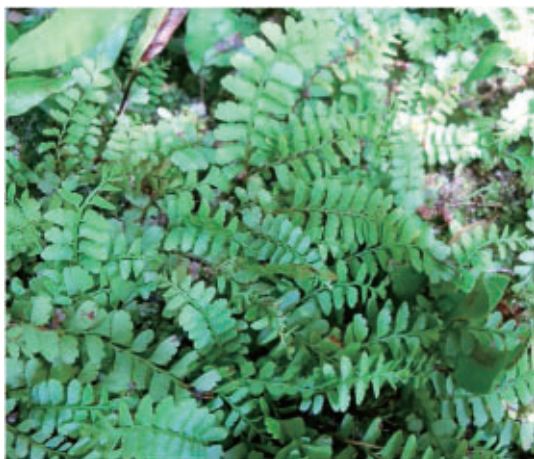
Fig. 2. Osmolindsaea × yakushimensis in Yakushima Isl., growing on moist, stream-side rocks (photograph by T. Oka in April 2013).