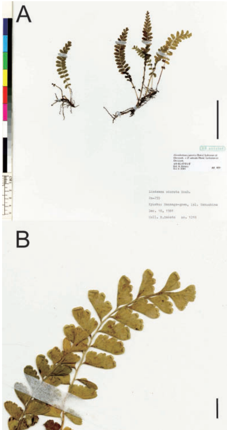
Fig. 1. Holotype of Osmolindsaea yakushimensis Ebihara et Nakato ( N. Nakato 1018 , TNS [VS-469765], voucher of chromosome count 2n=235 , pentaploid). A: the whole sheet (scale bar=5 cm); B: fertile lamina (scale bar=1 cm).