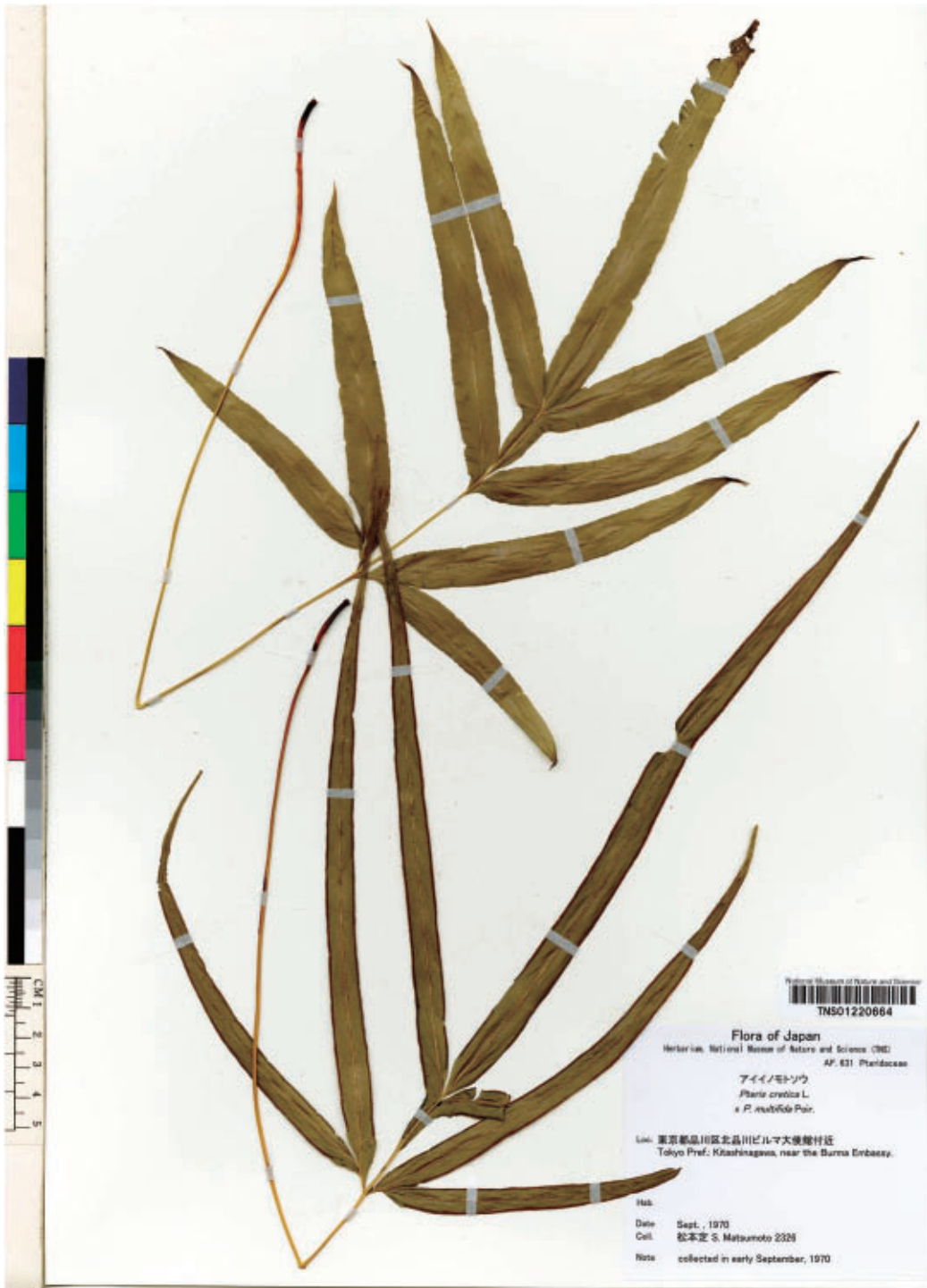
Fig. 4. Holotype of Pteris × pseudosefuricola Ebihara, Nakato et S. Matsumoto ( S. Matsumoto 2326, TNS [VS-1220664]).