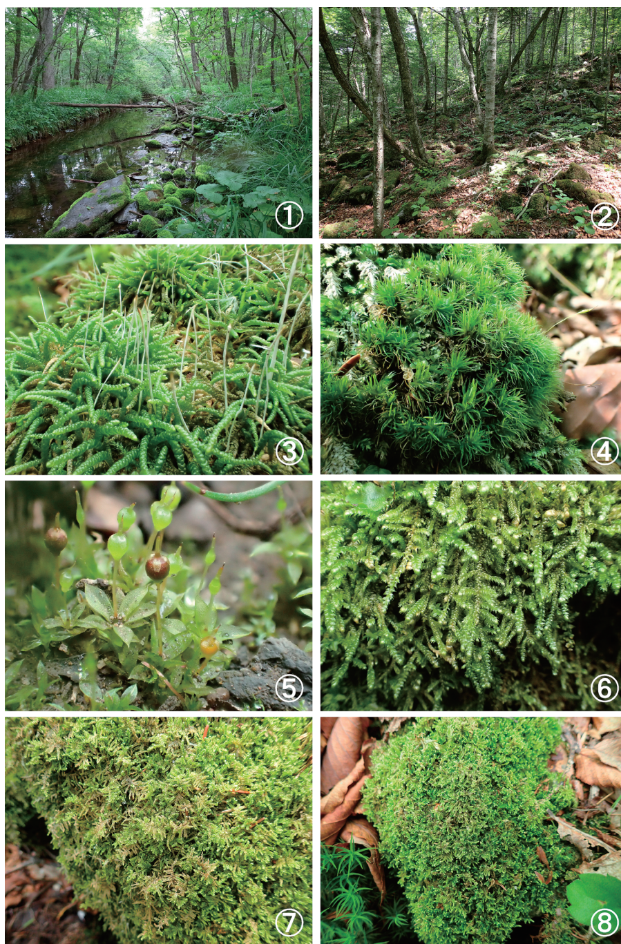
Figs. 1–8. 1. A broad-leaved deciduous forest, along a branch of Kedrovaya River, ca. 60m alt. 2. A mixed Betula sp, Abies holophylla and Pinus koraiensis forest, at upper course of Pervyj Zolotoj Stream, Kedrovaya River system, ca. 350m alt. 3. Myuroclada maximoviczii growing on boulder. Eocronartium muscicola , parasitic bryophilous basidiomycete, infected the species. 4. Dicranum mayrii growing on decaying log. 5. Physcomitrium sphaericum growing on soil. 6. Gollania ruginosa growing on basal part of trunk. 7. Hypnum oldhamii growing on boulder. 8. Hypnum tristo-viride growing on boulder.