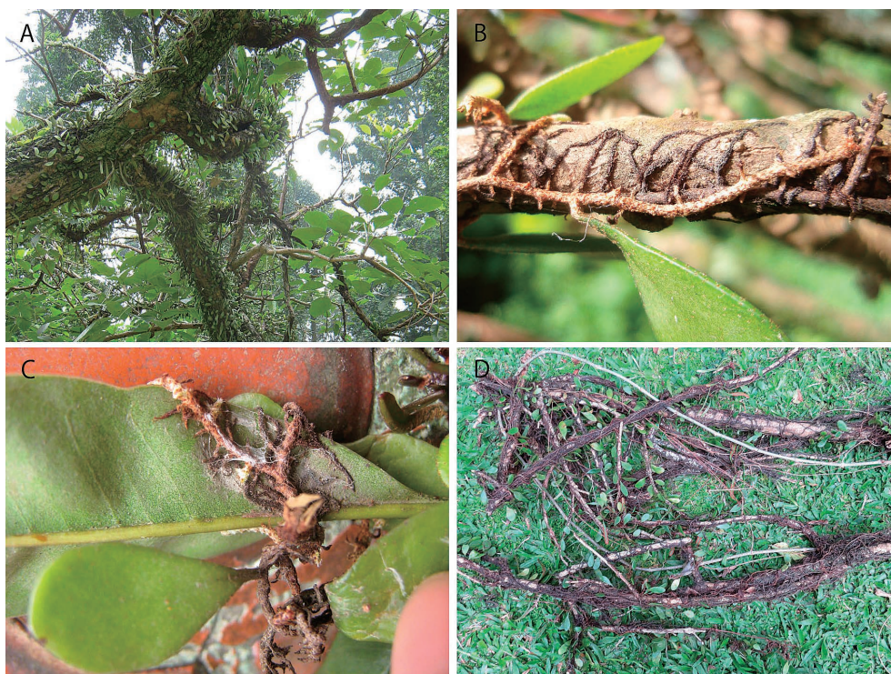
Fig. 1. Epiphytic Pyrrosia piloselloides on host plants. A. tree densely covered by the epiphyte. B. rhizome and roots of Pyrrosia piloselloides on a twig. C. rhizome and roots of Pyrrosia piloselloides on a host leaf. D. dried twigs fallen on the ground.