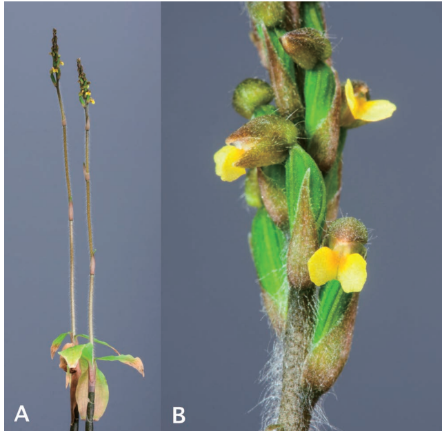
Fig. 3. Flowering individual of Zeuxine boninensis Tuyama from Minami-iwo-to Island, Ogasawara Islands, Japan. A. Habit. B. Close-up of flowers. Photographs taken in February 2018 from an ex situ collection of Takayama et al. 17062108.

er's instructions. Total DNA from the old herbarium specimens was extracted with a modified CTAB method of Doyle and Doyle (1987).