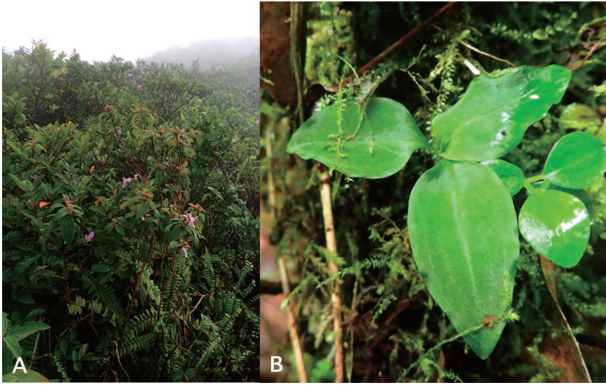
Fig. 2. Habitat of Zeuxine boninensis Tuyama on Minami-iwo-to Island, Ogasawara Islands, Japan. A. Scrub-forest at ca. 700 m height above sea level where this species grows. B. A sterile plant at the edge of forest. Photographs taken in June 2017.