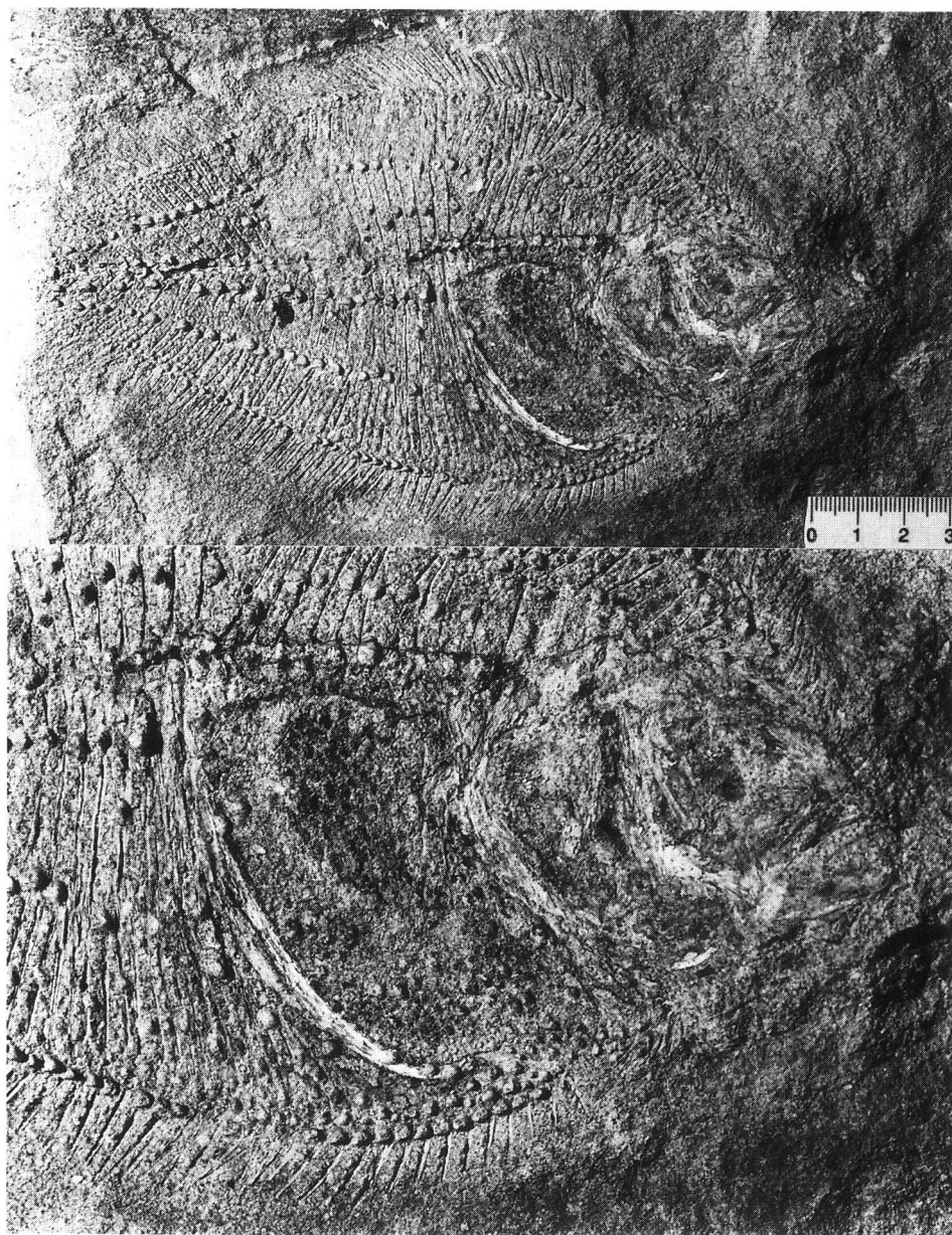
Fig. 2. The holotype of Clidoderma yamagataensis sp. nov., NSM PV-20520, from the Middle Miocene Ginzan Formation, Yamagata Prefecture, Japan (top); enlargement of the abdominal region of the holotype (bottom). About 200 mm in estimated standard length.