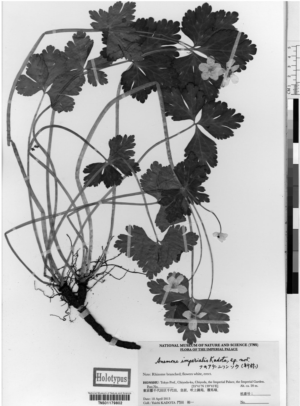
Fig. 2. Type of Anemone imperialis Kadota (Ôibaba-ato, the Imperial Garden, the Imperial Palace Ground, Chiyoda, Chiyoda-ku, Tokyo Pref., Honshu, Japan, alt. ca. 20 m, 18 April 2013, Y. Kadota s.n., TNS01179802, holotype).