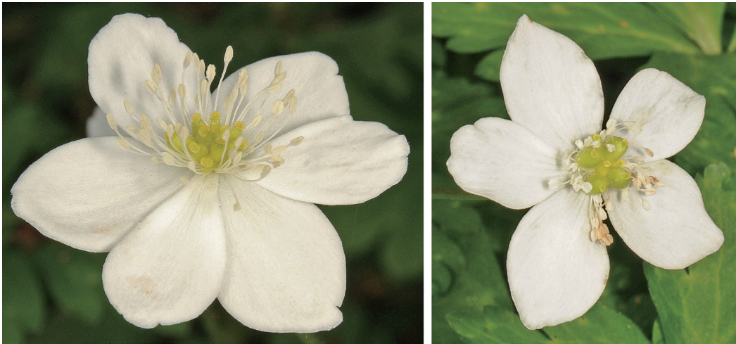
Fig. 6. Comparison of flower between Anemone imperialis Kadota (left) and A. flaccida F. Schmidt (right). Left. A. imperialis : Ôibaba-ato, The Imperial Palace Ground, 18 April 2013. Right. A. flaccida with immature achenes: Kanagawa Pref., Miura-gun, Hayama-cho, the Hayama Imperial Villa, 5 April 2013.

rhizomes shortly branched after flowering and the short branches were disengaged from the main rhizomes in late autumn to winter. The segregation of short branches is considered to cause asexual reproduction in both species.