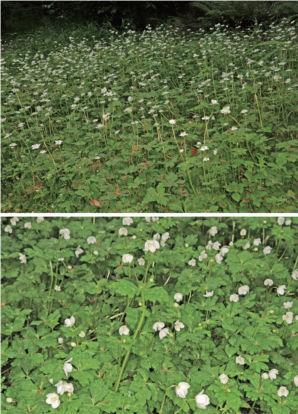
Fig. 1. Anemone imperialis Kadota at the Imperial Garden, the Imperial Palace, Tokyo, Japan. Top. On 18 April 2013 (good weather). Bottom. On 21 April 2012 (rainy weather).

Moto-Akasaka, Minato-ku, Tokyo Prefecture) and in March 2013 (at the fountainhead of the Hayama Imperial Villa, Hayama-cho, Miura-gun,