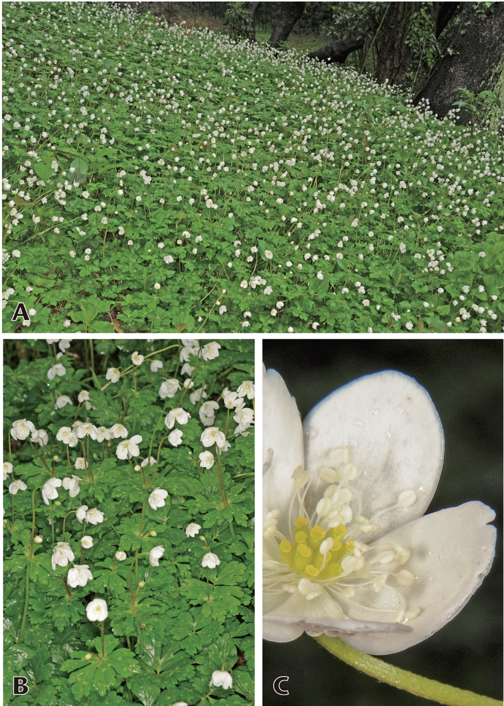
Fig. 4. Anemone imperialis Kadota in the Akasaka Imperial Grounds, Moto-Akasaka, Minato-ku, Tokyo Pref., Honshu, Japan. A. Habit. B. Nodding flowers. C. Flower showing pillow-shaped stigmata. On 23 April 2012 (rainy weather).