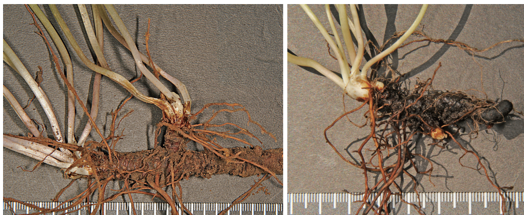
Fig. 7. Comparison of rhizome between Anemone imperialis Kadota (left) and A. flaccida F. Schmidt (right). Left. A. imperialis : Ôibaba-ato, The Imperial Palace Ground, 18 April 2013. Right. A. flaccida : Kanagawa Pref., Miura-gun, Hayama-cho, the Hayama Imperial Villa, 5 April 2013.