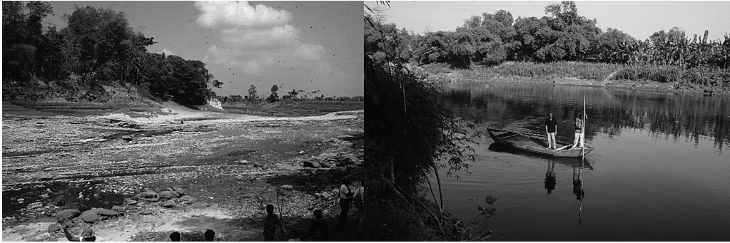
Fig. 1. The Sambungmacan canal site (left) and the discovery site of Sm 3 and 4 (right).