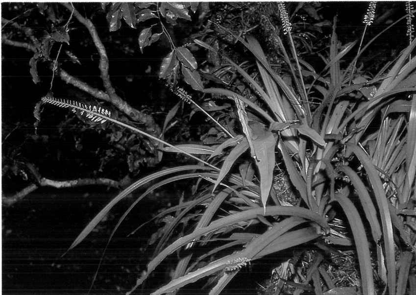
Fig. 3. Earina santoensis , plant on the tree in habitat.