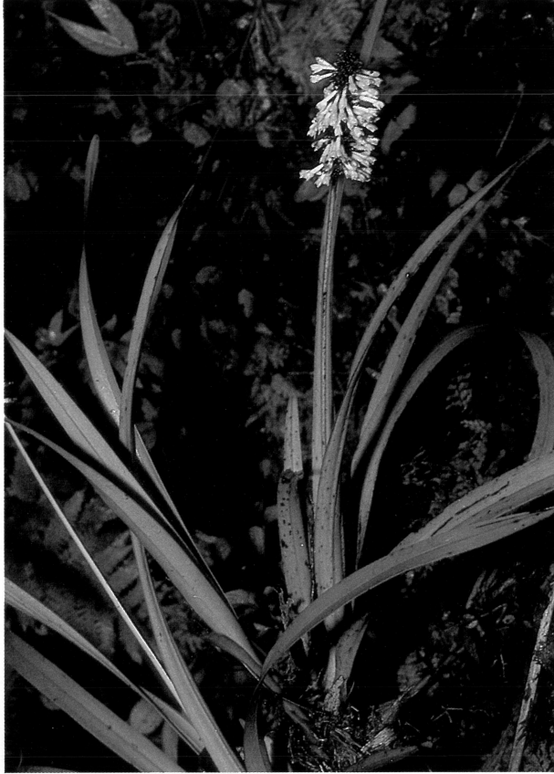
Fig. 2. Earina sigmoidea in habitat.