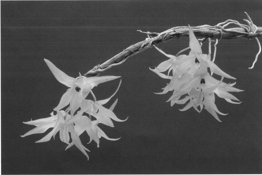
Fig. 2. Flowering individual of Dendrobium bifurcatum Yukawa. Photograph from holotype ( S. Khrukerd s. n. ).

column foot strongly incurved; operculum cucullate, bifurcate, dorsally sulcate, densely papillose, 3.5 mm long, 3 mm wide; pollinia 4, in 2 pairs, 1 mm long. Pedicellate ovary narrowly clavate, weakly sulcate, glabrous, 14-15 mm long.