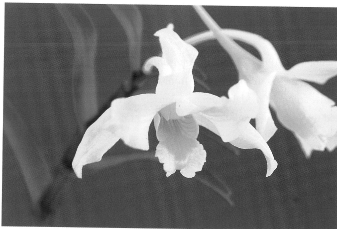
Fig. 4. Flowering individual of Dendrobium kontumense Gagnep. Photograph from cultivated material ( Hort. Tsukuba Botanical Garden accession number 118269 ).