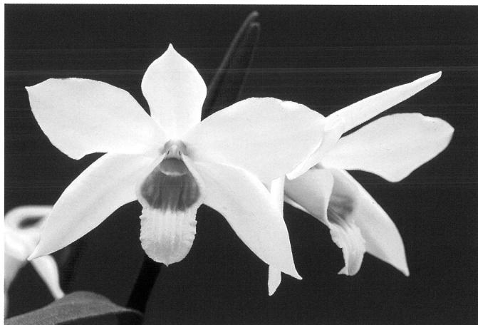
Fig. 2. Flowering individual of Dendrobium trankimianum Yukawa. Photograph from holotype ( Hort. Tsukuba Botanical Garden accession number 127511 ).

obovate-oblongate, abruptly acute, abaxial surface costate, 32 mm long, 12 mm wide. Lateral sepals obliquely triangular-falcate, acute-acuminate, abaxial surface costate, 33 mm long along anterior margin, 14 mm wide at base; mentum conical, slightly sigmoid, making an acute angle with ovary, 19 mm long. Petals oblongate-obovate, abruptly acute, abaxial surface slightly costate, 31 mm long, 15 mm wide. Labellum three-lobed, shortly clawed, adaxial surface with a broad, plate-like keel between side lobes, abaxial surface shallowly sulcate, 33 mm long, 23 mm wide; side lobes erect, obliquely triangular, obtuse, 17 mm long, 8 mm wide; mid lobe oblong, apiculate, weakly undulate, adaxial surface with five verrucose keels, 11 mm long, 10 mm wide. Column glabrous, dilated at base, 8 mm long, 4.5 mm wide at base; stielidia short, triangular-falcate, acute; column foot grooved, 9 mm long; operculum cucullate, quadrate, hirsute below, dorsally sulcate, densely papillose, 3.9 mm long, 3.1 mm wide; pollinia 4, in 2 pairs, 2.5 mm long. Pedicellate ovary clavate, slightly sulcate, glabrous, 30 mm long.