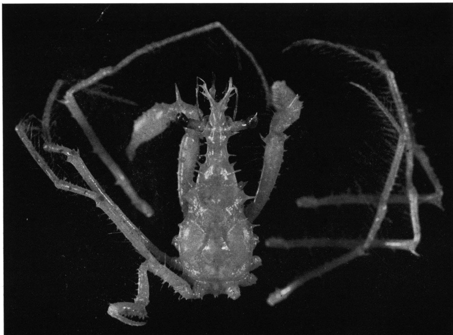
Fig. 1. Grypachaeus tenuicollis sp. nov., ♂, holotype.

Eyestalk large, with a strong basal constriction, and movable backward, but en-