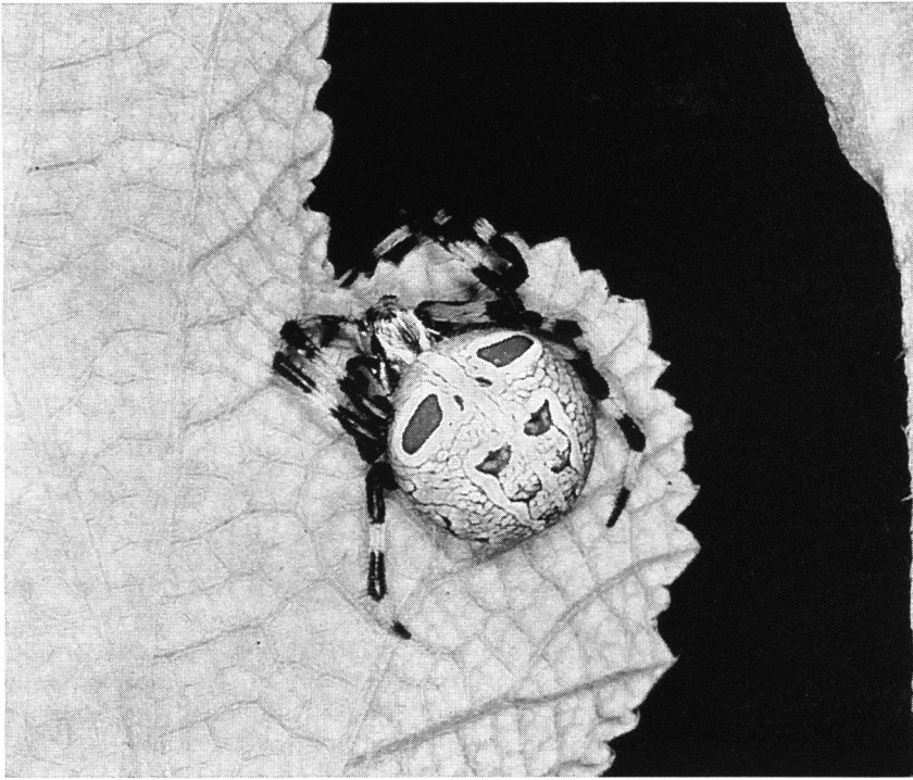
Fig. 1. Araneus roseomaculatus sp. nov., female holotype.

Coloration and markings. In alcohol: Carapace yellowish brown with a brown stripe at the middle and a pair of dark brown stripes at the sides. Chelicerae dark brown, distally much darker, maxillae and labium blackish brown with white margins, sternum white, both the sides blackish brown. Legs: femora yellowish white with blackish brown markings at the middle, other segments blackish brown, with wide, yellowish white rings on the metatarsi and tibiae. Femur of palp white, other segments dark brown, tibia with a white ring. Opisthosoma dorsum light beige, with a pair of yellowish brown markings on the anterior part; venter blackish brown with three pairs of white patches (Fig. 2). Coloration of living spider: Prosoma silvery grey, legs blackish with white rings, opisthosoma bright yellow, the pair of markings on the anterior part vivid rose-red margined by white.