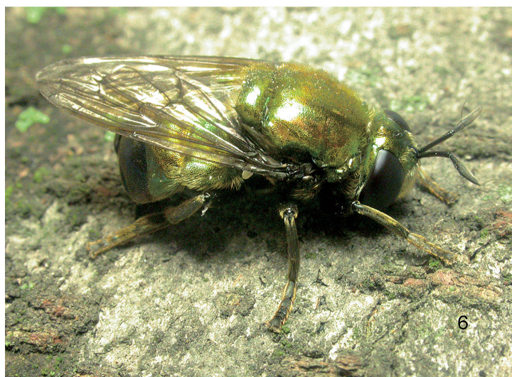
Figs. 5, 6. Microdon katsurai sp. nov., living individuals. 5, Male, anterolateral view; 6, female, ditto.