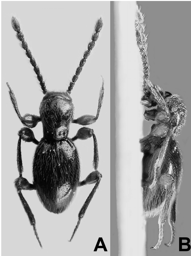
Fig. 1. Syndicus caugiguanus sp. nov., holotype male: dorsal (A) and lateral (B) views. Actual length 2.97 mm.