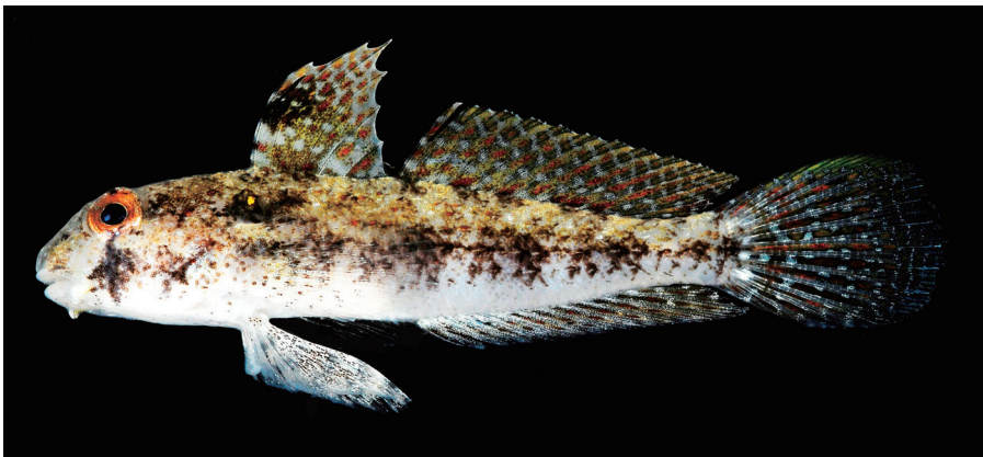
Fig. 3. Paratype of Gnatholepis yoshinoi , male, OMNH-P 34800, male, 24.9 mm SL, Okinawa.