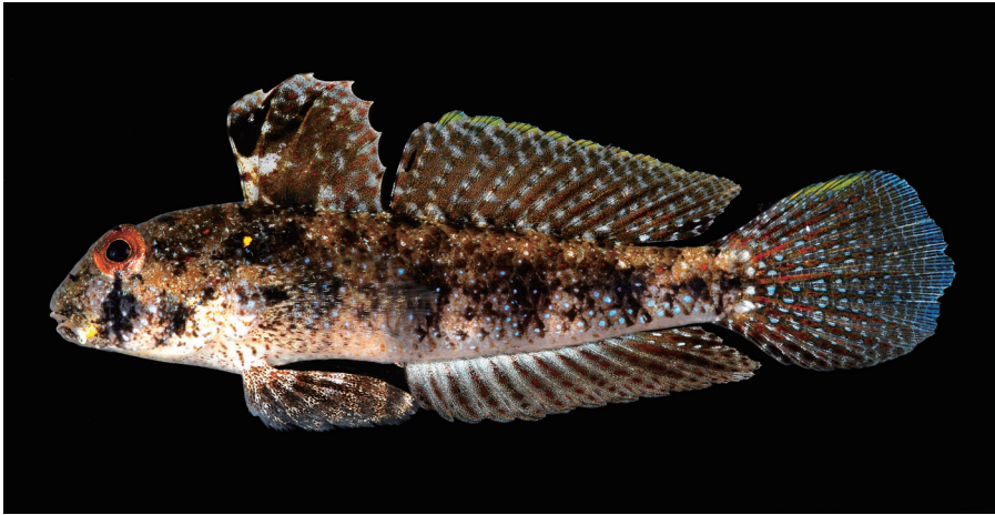
Fig. 1. Holotype of Gnatholepis yoshinoi , male, NSMT-P 91420, 30.8 mm SL, Okinawa.