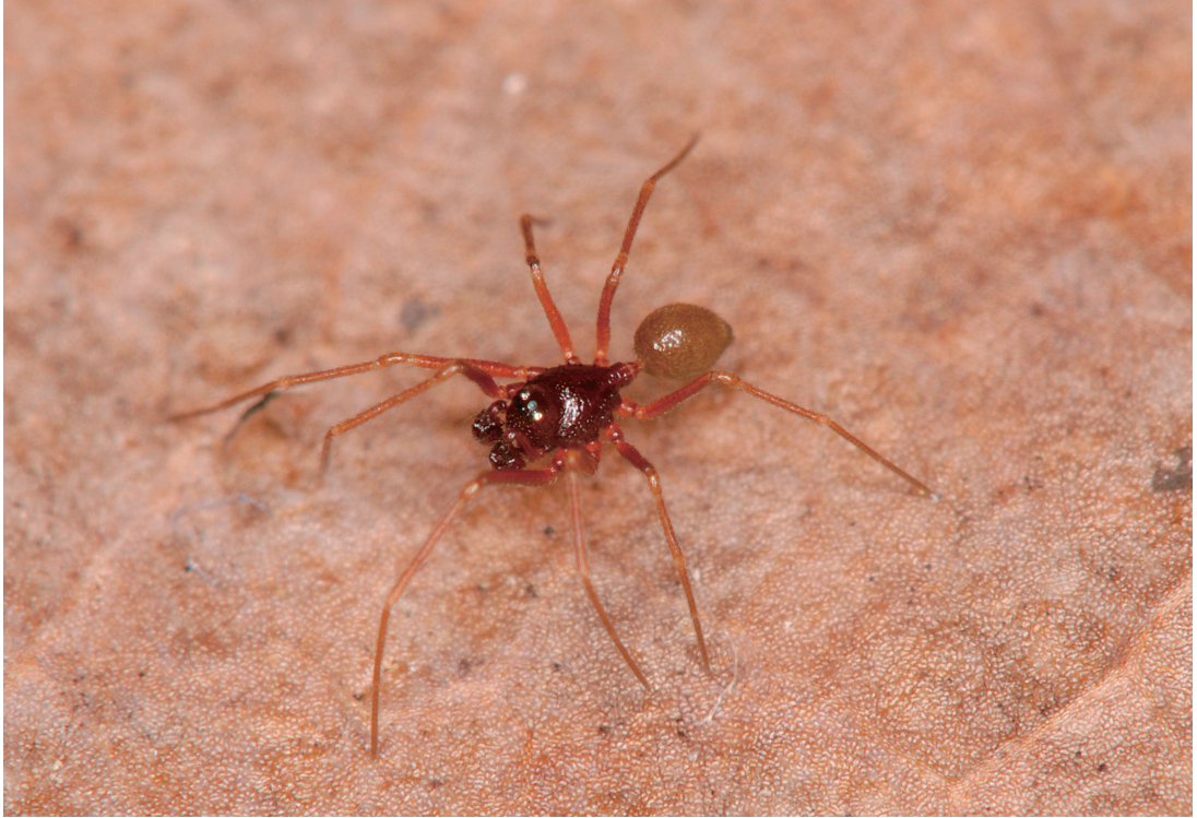
Fig. 17. Solenysa ogatai Ono, sp. nov., male, one of the paratypes from Toyota-shi (NSMT-Ar 9762), body length 1.22 mm.