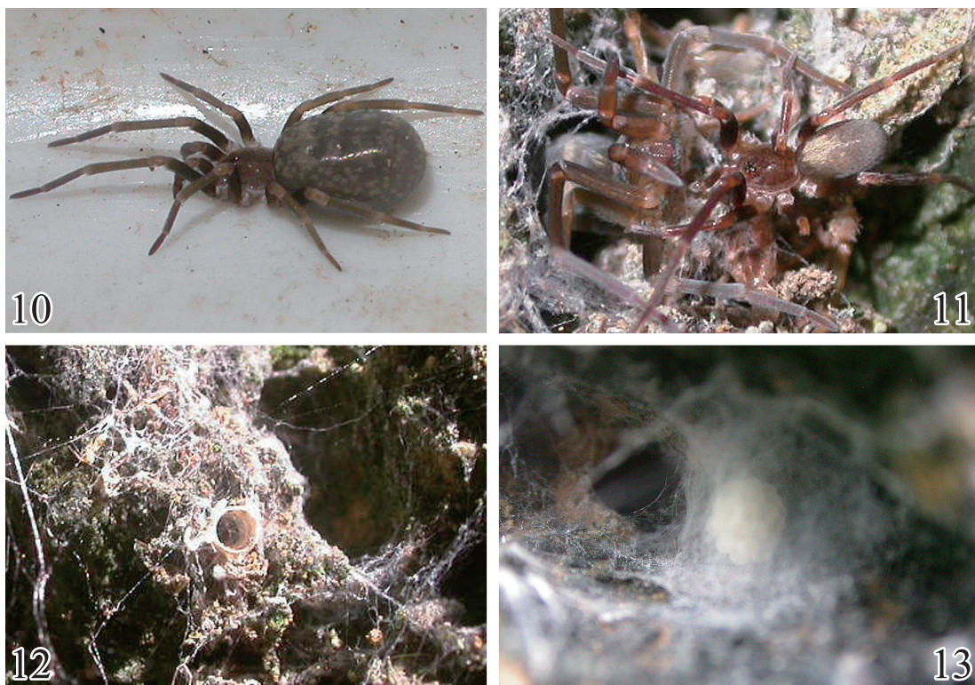
Figs. 10–13. Tricalamus ryukyuensis sp. nov. — 10, Female (one of the paratypes), body length 4.98 mm; 11, female (left) and male (right) at the entrance of the female's retreat, body length of the male, 2.58 mm; 12, web of a female, diameter of the entrance of retreat, ca. 5 mm; 13, egg sac, diameter of the cluster, ca. 3 mm.

forest. Webs are made of delicate threads with a simple round entrance of tubular retreat at the middle (Fig. 12). An egg sac with about 40 eggs in the retreat was photographed (Fig. 13).