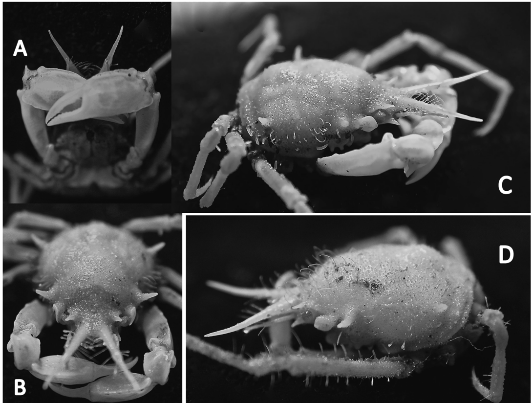
Fig. 2. Rochinia miyakensis sp. nov., holotype ♂ (A–C) and allotype ♀ (D).

11.2 mm, LR 5.4 mm) (Figs. 1C–D, 2D). The general outline of the carapace is pyriform, but seemingly narrower than the holotype male. In dorsal view, the carapace is elongate triangular rather than pyriform probably due to the weakly developed gastric and hepatic regions. The branchial tubercles of both sides are only slightly shorter than the hepatic tubercles. The postorbital lobe is oval, with weakly pointed median part of distal margin.