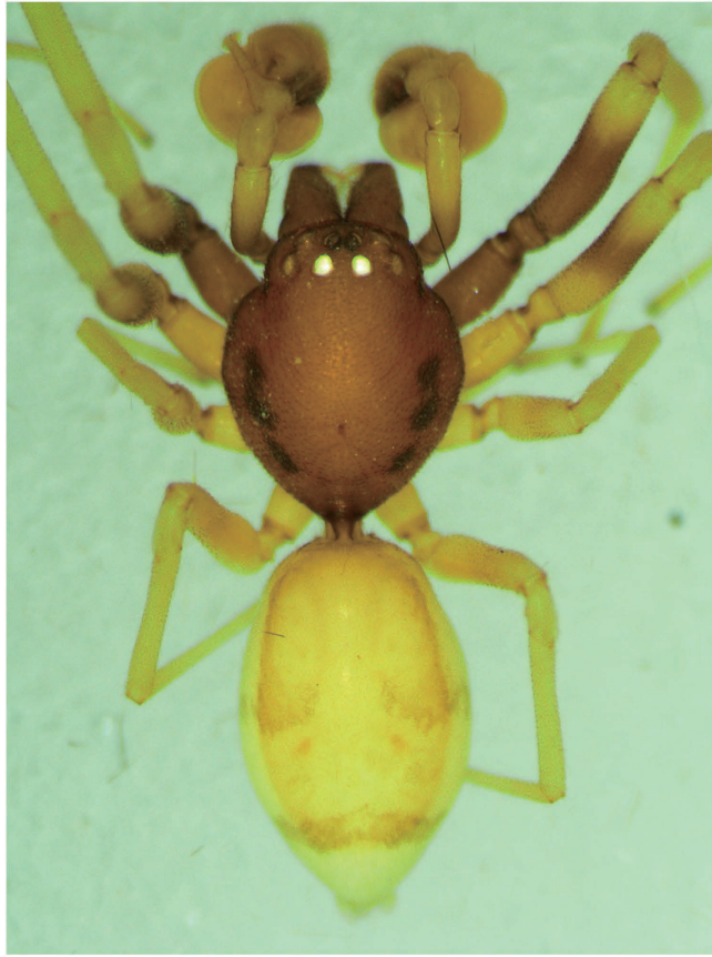
Fig. 1. Utivarachna phyllicola Deeleman-Reinhold, 2001, a male from Lampi Island, Myanmar. Body length: 3.6mm.