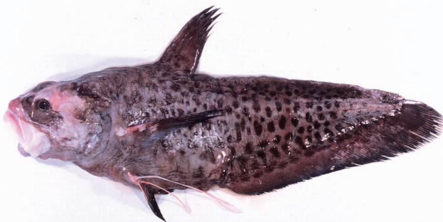
Fig. 2. Guentherus kato sp. nov., thawed out specimen, KPM-NI 16647, holotype, 643.7 mm SL, Kumanonada Sea.

Coloration in preserved specimens. Reddish color disappeared; most parts of head, body and fins dark; spots on body barely recognized.