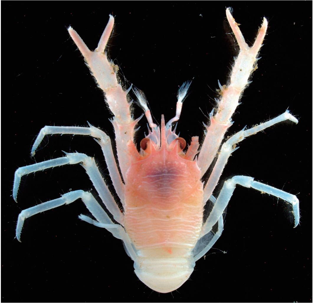
Fig. 1. Munida ampli antennulata sp. nov., holotype, female (cl 7.0 mm), CBM-ZC 10020. Habitus, dorsal view, showing coloration in fresh.

carina low, faintly tuberculate, extending from midlength of rostrum to beyond level of epigastric spines. Cervical groove distinct. No conspicuous spines other than epigastric spines present on dorsal surface. Anterior part of branchial region between cervical groove and transverse groove with scattered granules. Frontal margins very slightly oblique. Lateral margins feebly convex. Anterolateral spines each located at anterolateral angle, relatively small, distinctly posterior to sinus between rostrum and supraocular spines. Second marginal spine anterior to cervical