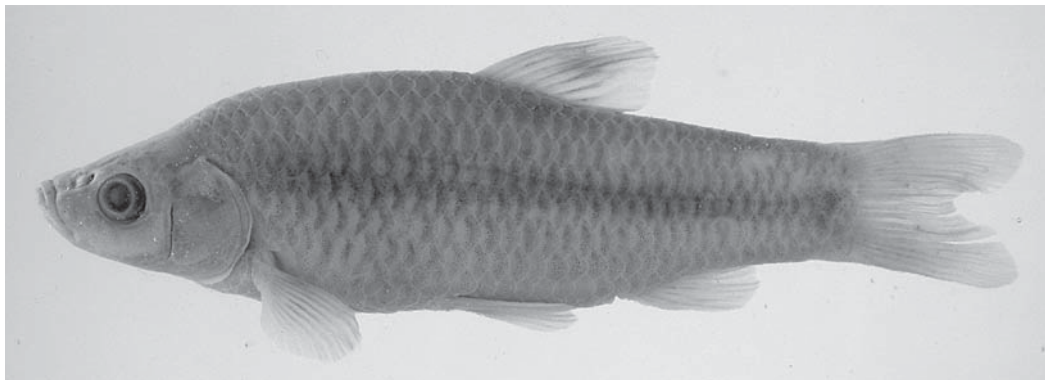
Fig. 3. Pseudorasbora pumila pumila Miyadi, 1930, collected from Shinai-numa Pond, Miyagi Prefecture, Japan (NSMT-P 73379, 6.3 cm SL).

In addition to freshwater fishes, the fish collection of Saito Ho-on Kai Museum of Natural History showed northern range extensions of the following fishes: Ophichthus altipennis (Ophichthidae, previously known as far north as Tokyo Bay), Caelorinchus anatirostris (Macrouridae, previously known as far north as Sagami Bay); Antigonia capros (Caproidae, previously known as far north as Sagami Bay); Hoplichthys gilberti