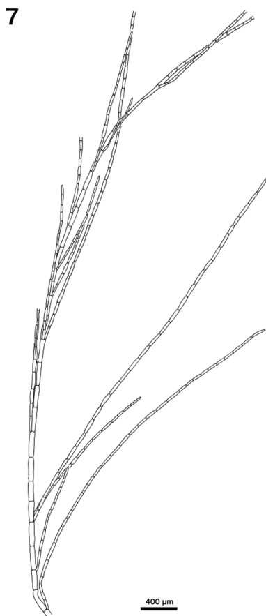
Fig. 7. Lychaete bainesii (F.Müller et Harvey ex Harvey) M.J.Wynne from Ogasawara Islands, Japan. Upper branch system.

Island (27°8'N, 142°11'E), 16 July 2017, leg. T. Kitayama (TNS-AL 210219) (Fig. 2).