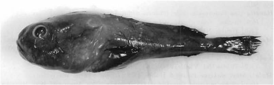
Fig. 2. Fresh specimen of a psychrolutid fish, Psychrolutes phricus Stein & Bond, 1978, from the East China Sea (NSMT-P 67570, 13.1 cm SL).

species occurs from the Pacific Coast and Okhotsk Sea off Northern Japan, eastward to the eastern Bering Sea and eastern North Pacific at depths of 800–2800 m depths. This specimen represents the southernmost and shallowest record for this species.