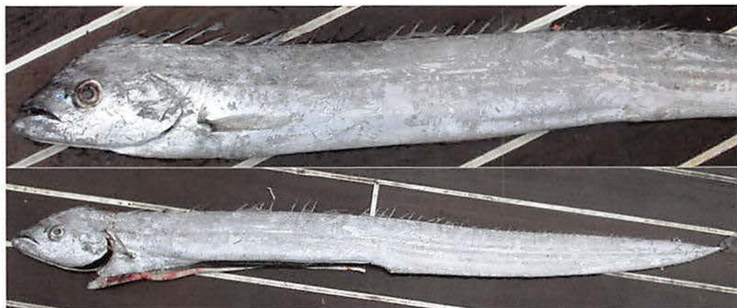
Fig. 3. Fresh specimen of a trichurid fish, Evoxymetopon taeniatus Gill, 1863 from the East China Sea (154.5 cm SL).

Trichiurus lepturus : Machida, 1985; Yamada, 1986a